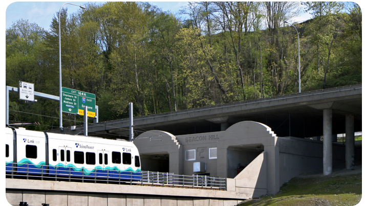
Beacon Hill tunnel portal